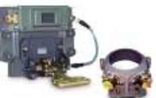
Third Rail Current Collectors Ground Return Systems