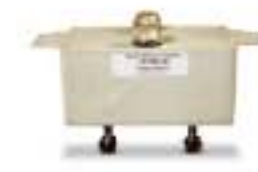
Hazardous Voltage Detectors