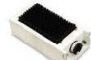
Traction Gate Drivers