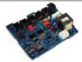
Gate Drivers for GTO's, IGBT's, and SCR's