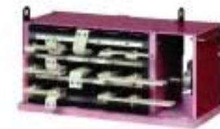
Power Transfer Switches