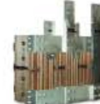
Heat Sink Assemblies