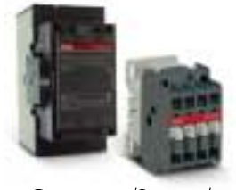
Contactors/Starters/ Circuit Breakers