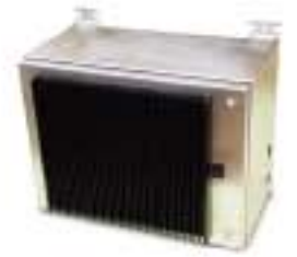
Dead Battery Starters